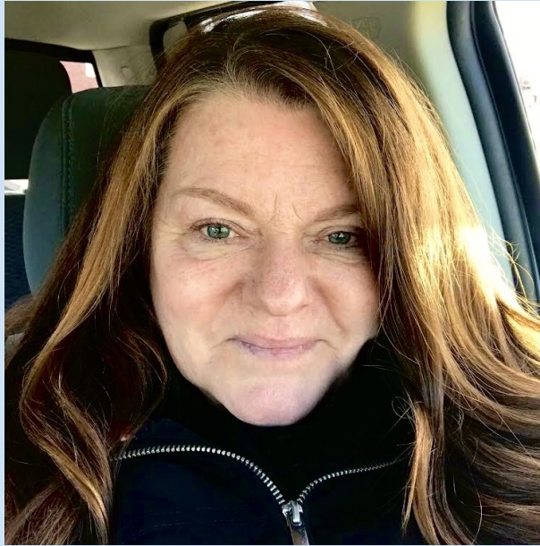
Teacher, French & Dean of Students