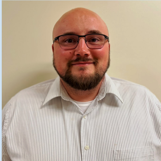
Teacher, History & Dean of Students